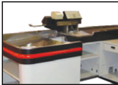
Scan, bag & chute-checkout