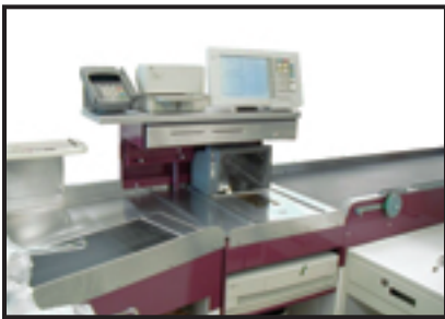
Belted take away lane